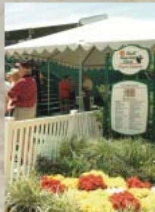
Charity Partners gain additional exposure with on-course signage.

For additional information contact the HGA office at 281-454-7000 or hgaoffice@hga.org.